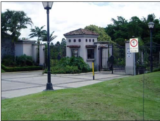
Zurqui Hills entrance (under construction)

Every lot will be accessed by paved road and provided with underground power and telephone service.